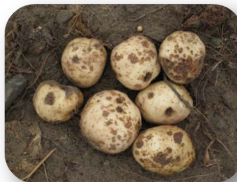
Figure 8: Common scab disease in potato.

organism that causes disease only on tubers. Some varieties are more resistant than others to scab; tolerant varieties include Onaway and Superior. Tubers with scab are fine to eat. Just peel or cut off the circular rough skin.