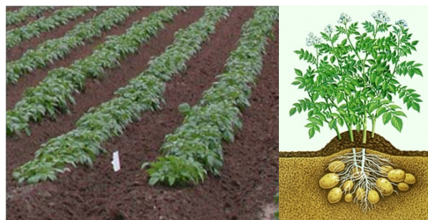
Figure 7: When the plants are 8-12 inches tall they should be hilled to keep tubers covered and prevent greening.

Potato plants should be “hilled” when the plants are 8 to 12 inches tall (Figure 7).