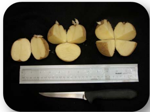
Figure 5: Tuber seed piece cuttings.

per section and a maximum sprout length of 1/4 to 1/2 inch to ensure optimum germination. Seed tubers can be cut and planted on the same day, however allowing the cut surface to heal over for 4-7 days may reduce the risk of seed pieces rotting in the soil.