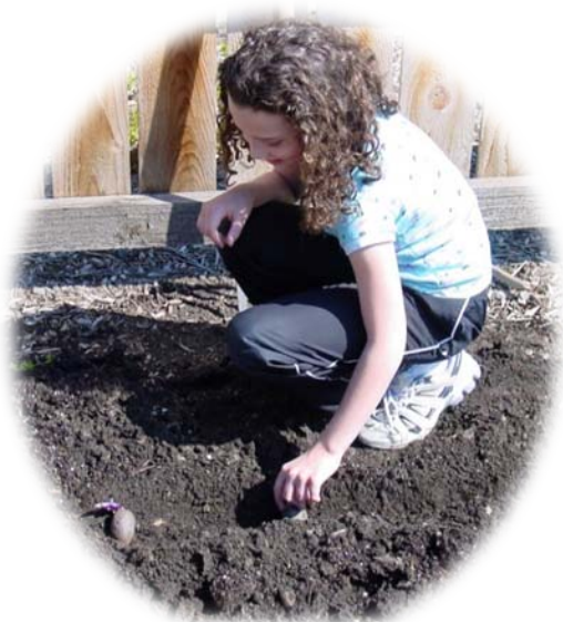
Figure 6: Plant seed pieces 3 to 4 inches deep and space 9 to 12 inches apart.

Potatoes are a cool season crop; ideal temperatures for crop growth are 65 to 80 during the day and 55 to 65 at night. The soil should be cultivated 6 to 8 inches deep in the spring, and large soil clods should be broken up or removed before planting. Plant potatoes when soil temperatures are above 45 F. Cold, wet soil at planting time increases the risk of seed piece decay, and planting into cool, dry soils can cause delayed sprouting and emergence of the potatoes.