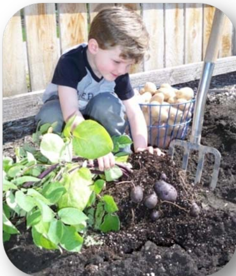
Figure 1. Children love helping in the garden and getting dirty is an added bonus.

Growing potatoes is fun and not that hard! Home gardeners can grow unique varieties that are not sold in local supermarkets. Potatoes come in all different shapes, sizes and colors. Did you know that there are purple, red and yellow potatoes? Potatoes make a great garden project for your children or grandchildren.