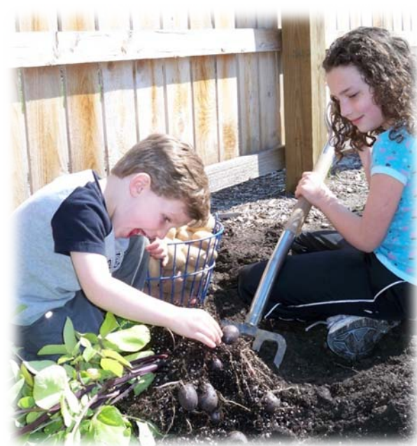
Figure 10: Since potatoes grow underground, harvest time is always a big surprise!

Harvest potatoes before a severe frost. Use a spade or fork to loosen the soil and gently lift the tubers out of the soil (Figure 10). To prevent greening and sunburn damage, do not allow tubers to be exposed to light after harvesting.