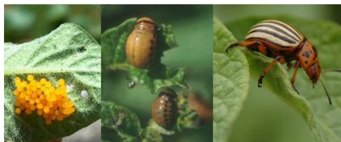
Figure 9: The Colorado potato beetle eggs, larvae and adult stages.

The potato is subject to several seed, foliar and tuber disorders that may affect quality and appearance. See Table 1 (Page 6) for information on the potato disorders most common to home gardeners.