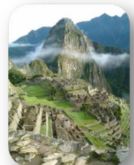
Figure 3. Peru, South America .

Potatoes are native to the Andean region of South America. European explorers introduced the potato to Europe in 1536 but it did not arrive in the United States until 1719 when Irish immigrants brought the potato with them to the New World.