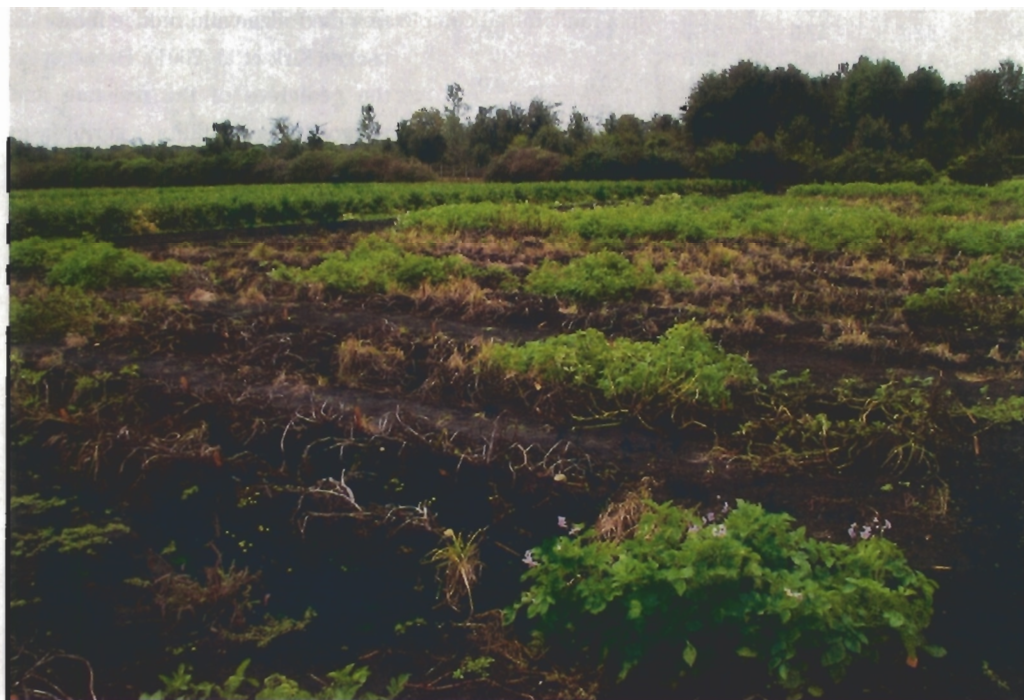
FIGURE 2. Late blight field trial ~30 days post inoculation with P. infestans at the Michigan State University Muck Soils Research Farm, Bath, Michigan.