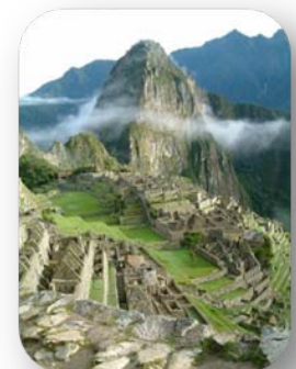
Figure 3. Peru, South America .

Potatoes are native to the Andean region of South America. European explorers introduced the potato to Europe in 1536 but it did not arrive in the United States until 1719 when Irish immigrants brought the potato with them to the New World.