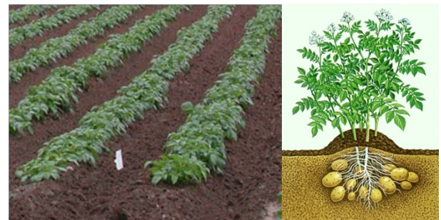
Figure 7: When the plants are 8-12 inches tall they should be hilled to keep tubers covered and prevent greening.

Potato plants should be “hilled” when the plants are 8 to 12 inches tall (Figure 7).